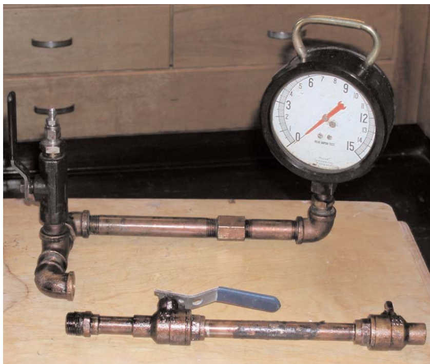
Figure. Oil-sampling device developed for heavy oil tank emissions test.